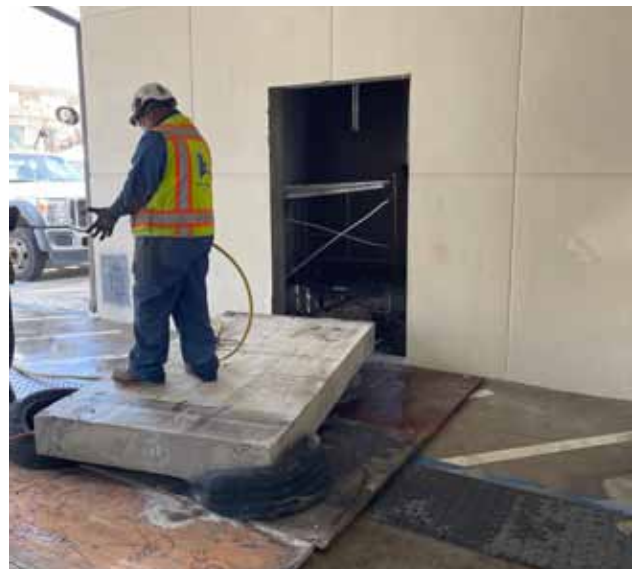
THE NEW DOOR OPENING INTO THE OLD BOILER ROOM UNDER THE REAR AWNING OF OLD FIRE STATION ONE. THIS WILL BE THE ENTRANCE POINT FOR THE NEW FOUR (4) BATHROOMS. NOTE HOW THICK THE CONCRETE EXTERIOR WALLS ARE AT 8 INCHES.