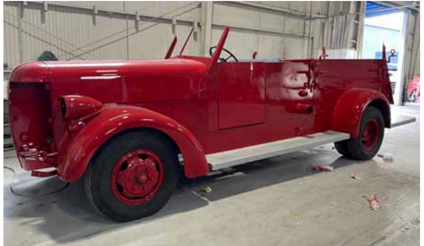
OUR 1945 AMERICAN LAFRANCE (FIRE ENGINE CO. # 6) WAS PAINTED BY MAACO AUTO BODY SHOP AND HERE IT IS COMPLETED ON FEBRUARY 6TH, 2025.

Private BBQ to invited guests with interest of being a Major Partner/Donor with the SJFM. A Presentation and overview will take place from 4 to 6 pm along with a Free BBQ. RSVP is required for this BBQ event.