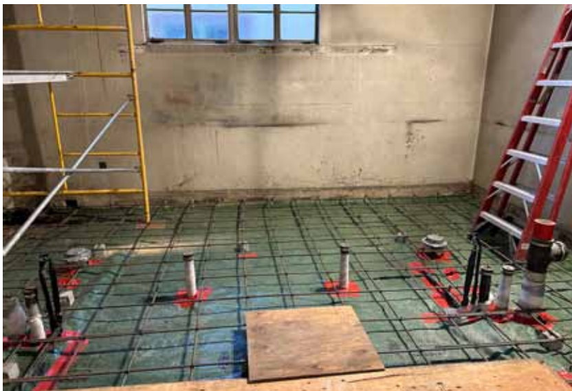
THE OLD BOILER ROOM FLOOR IN FINAL PREPARATION AT OLD FIRE STATION ONE BEFORE NEW CONCRETE FLOOR IS POURED.

The fire service has come a long way since the days of the tailboard Firefighter and today Firefighters are much safer and better prepared when arriving on scene.