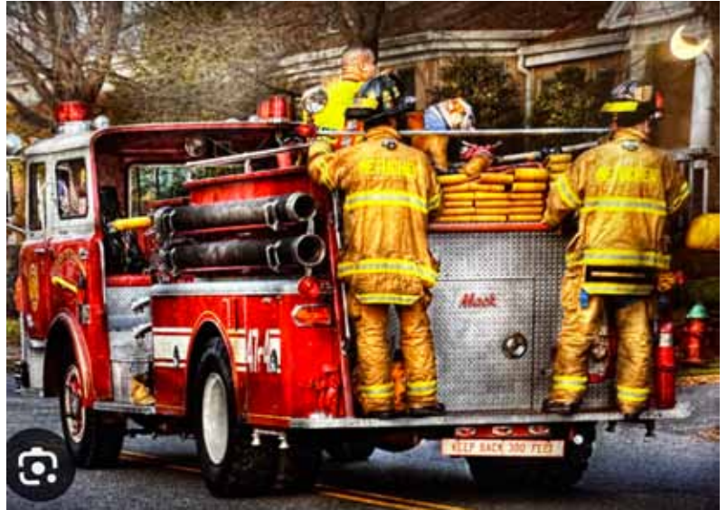
THE TAILBOARD FIREFIGHTER ON THE SJFD WAS GONE BY 1980.

Riding on the tailboard, besides being an interesting way to travel to an incident, was more than just hanging on to a crossbar and standing on the tailboard. The Firefighter had to be aware of their surroundings and keep their knees slightly bent to absorb the bounce of the engine going over bumps on the road or train tracks. The firefighter was also exposed to the elements and on calls during inclement weather the Firefighters could be seen trying to protect themselves from the cold or rain by ducking under the hose bed cover. One of the most feared noises while riding the back of the engine was hearing tires screech behind the engine. Firefighters were always ready to jump up on the hose bed or off the engine when hearing that sound. Also the tailboard firefighter did not have communications so the only way they knew it was a working fire was to see the smoke as they were responding. Further, when arriving on the scene when a self-contained breathing apparatus(SCBA) was required, the tailboard firefighter needed to step off the tailboard, go to the compartment and put on the SCBA, delaying getting involved in the incident.